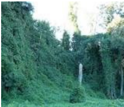
Kudzu like that along Hwy 71 around Artist Point.

Using foliar herbicides is often considered a “last resort” for many of us conservationists. Still, sometimes it’s the least-destructive tool available, ecologically speaking, for managing incredibly invasive species like kudzu. Using a selective herbicide is strongly recommended when forced to use a foliar herbicide. Selective herbicides, especially those which quickly metabolize in soil, have