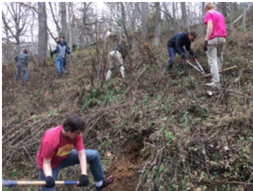
Workers at Tunnel Park

It was a pleasure talking with you last Wednesday about finding ways the City of Winslow can proactively help its residents manage the increasing kudzu infestation in the area. As detailed in the Site Assessment plan developed by the Alliance and provided to the Winslow Community Development Council, kudzu is challenging to manage and control without herbicide. Kudzu grows incredibly fast, often on dangerous slopes, and quickly becomes overwhelming. Many experts and conservationists seem to recommend using the foliar herbicide Clopyralid, often sold under the trade names Transline®, Stinger®, Reclaim®, Curtail®, and Lontrel®.