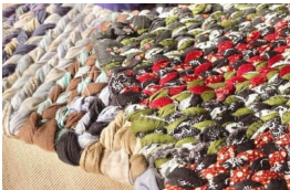
Fiber Saturday Sat., March 23 @ 10am