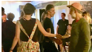
Two Step and Square Dance Sat., March 23 @ 6pm