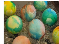
Egg Dying for Kids Sat., March 30 @ 10am