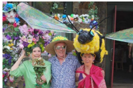
Easter Bonnets Sat., March 23 @ 11am