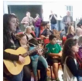
Squirrel Jam Sun., March 24 @ 5pm