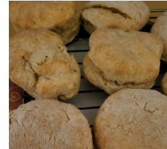
Sourdough Starter Workshop with Nena Hammer Saturday, April 1 @ 12pm