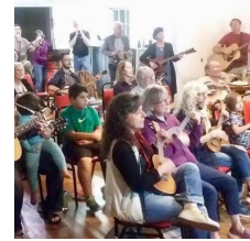
Squirrel Jam 4th Sunday Music Night March 26 @ 5pm