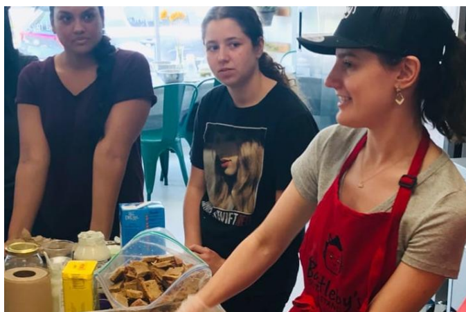
Seitan School Workshop Saturday, July 23 @ 12pm