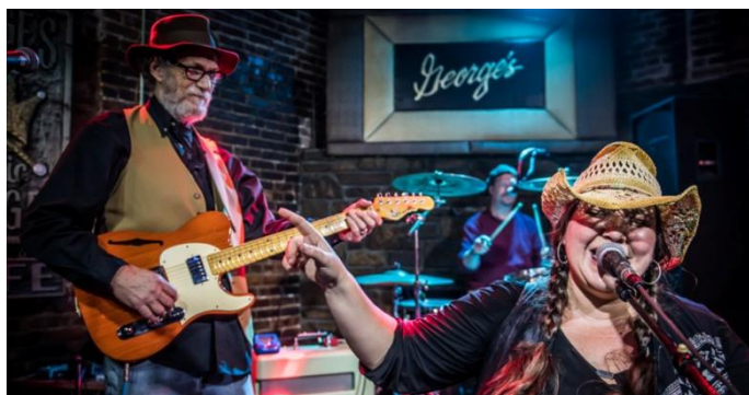
Brick Fields Duo Concert Saturday, July 2 @ 6pm