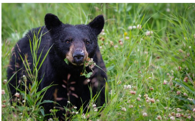
Bears of Arkansas Saturday, July 30 @ 2pm