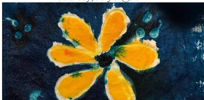
Faux Batik Workshop Saturday, July 9 @ 1pm