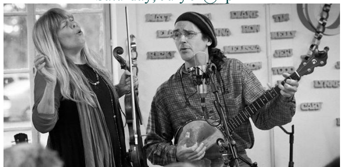
Still on the Hill Concert Saturday, July 16 @ 6pm