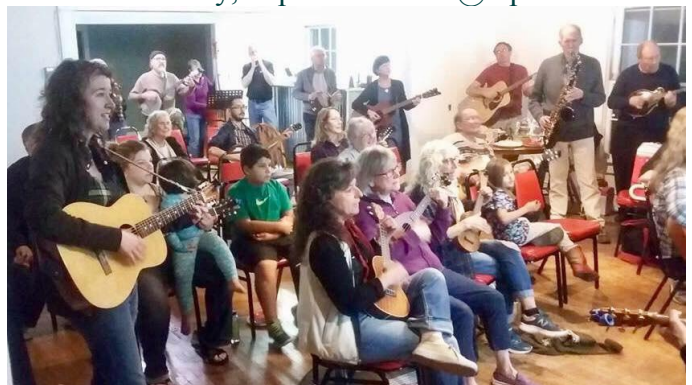
Squirrel Jam 4th Sunday Open Music Night Sunday, September 25th @ 5pm

Visit our gallery of Ozarks arts & crafts any Friday through Sunday between 12pm and 4pm or our online gallery at OzarkFolkways.org .