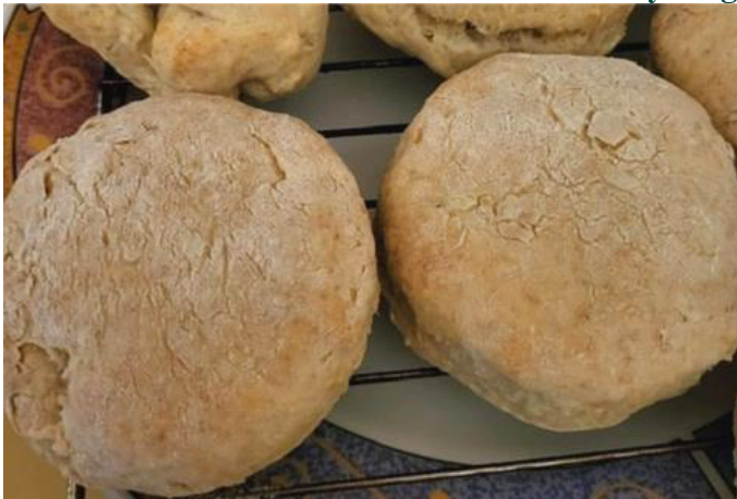
Sourdough Starter Workshop Saturday, September 10 @ 10am

Support for Ozark Folkways is provided, in part, by the Arkansas Arts Council, an agency of the Arkansas Department of Parks, Heritage, and Tourism, and the National Endowment for the Arts.