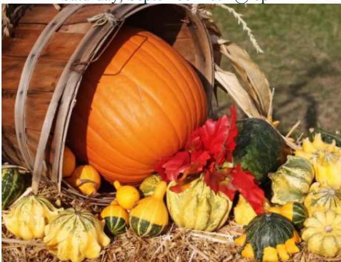
Ozarks Autumnal Brunch Cooking Workshop Saturday, Sept 24 @ 10am