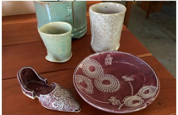
Ceramics Fun with Cheryl Buell Sunday, September 25th @ 2pm