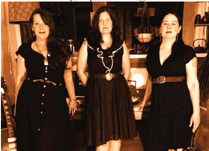
The Hoecakes Concert Saturday, September 10th @ 6pm