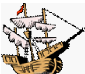
Columbus Day October 12, 2020