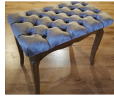
UPHOLSTERY FOR BEGINNERS W/LAURA JANE SAT, SEPTEMBER 14 @ 1PM