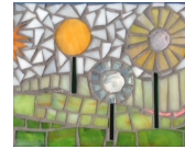
GLASS ON GLASS MOSAICS W/STEVIE STEVENS SAT, SEPTEMBER 28 @ 12PM