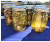
PICKLING WORKSHOP W/KYLE OXFORD SAT, AUGUST 31 @ 1PM