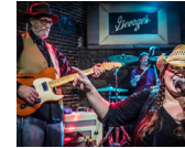
BRICK FIELDS DUO CONCERT SAT, OCTOBER 5 @ 6PM

Visit the gallery to find one of a kind gifts and trinkets!