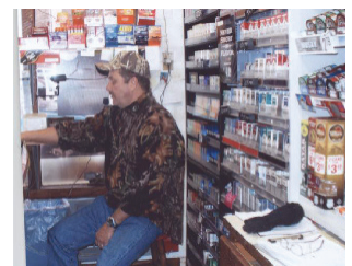
Cigarettes and Tobacco Products