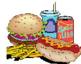
Sandwiches & Soda