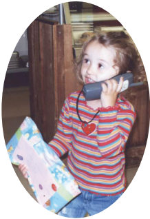
Phone Orders Welcome

Open 6:00 AM to 9:00 PM 7 Days a Week 479-634-2030