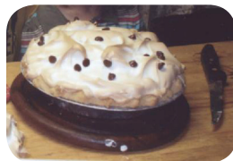
Homemade Pies, Cakes & Breads