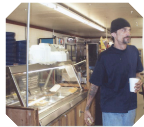
Breakfast and Lunch Served Daily