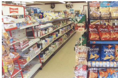
Groceries & Picnic Supplies