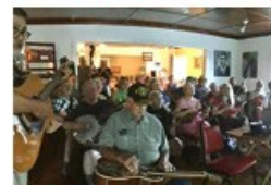
SQUIRREL JAM SUN, JUL 27 @ 5PM