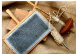
FIBER PLAY SATURDAY SAT, JUL 19 @ 10AM