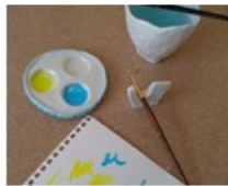
PAINT PALETTE SETS W/JENNY DOWD SAT, JUL 12 @ 1PM

22733 N Highway 71 • Winslow AR 72959 • 479-634-3791 • info@ozarkfolkways.org OPEN FRIDAY, SATURDAY & SUNDAY 12:00 - 4:00