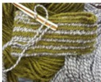
NALBINDING W/CAROLYN HALEY SAT, JUL 19 & 20 @ 1PM