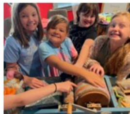
WHISTLE & WARP KIDS' FIBER & MUSIC CAMP AUG 4 THROUGH 8 9AM TO 3PM

Visit the gallery for unique art and gifts!