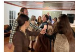
POTLUCK & SQUAREDANCE SAT, JUL 26 @ 6PM