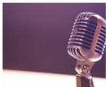
SONGWRITING SQUIRRELS SAT, JUL 19 @ 5PM