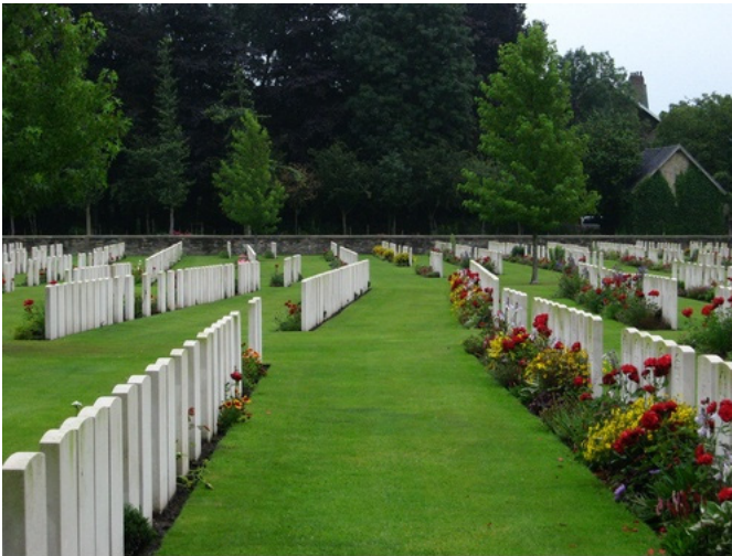
photo © 2007 RDV/RS, Flickr http://creativecommons.org/licenses/by/2.0/

Other writers I know admit to the same problem. What in the world can I write that anyone would possibly find interesting enough to read? Hint: Use lots of pictures then you don't have to write so much.