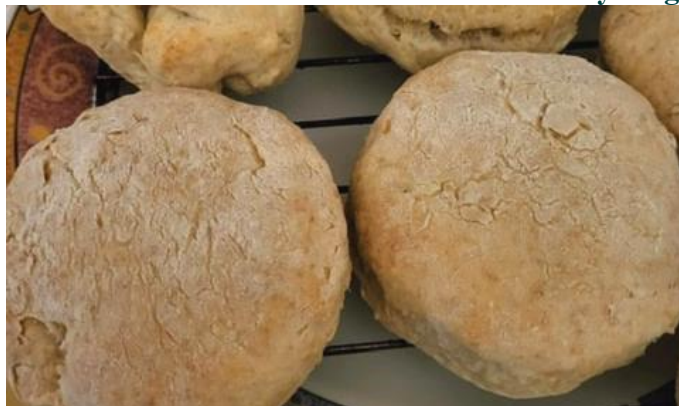
Sourdough Starter Workshop Saturday, October 8 @ 10am