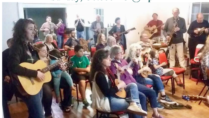
Squirrel Jam 4th Sunday Open Music Night Sunday, October 23 @ 5pm

Visit our gallery of Ozarks arts & crafts any Friday through Sunday between 12pm and 4pm or our online gallery at OzarkFolkways.org . If you'd like to exhibit your art, lead a workshop, perform music, or volunteer in any capacity, send us an email at info@ozarkfolkways.org