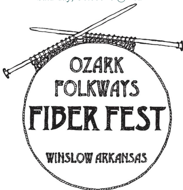
Annual Folkways FiberFest October 14-16