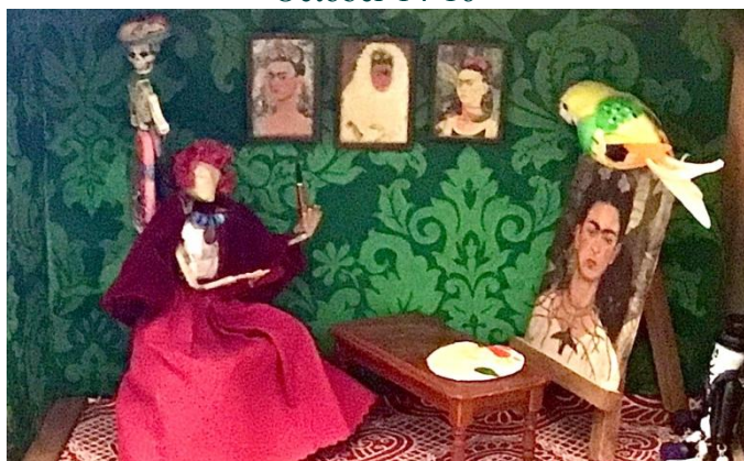
Out of the BoX Art Show Reception Sunday, October 23 @ 4pm-7pm