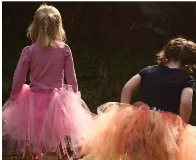
No-Sew Tutus for Kids Saturday, October 22 @ 1pm